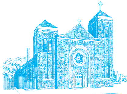
St. John Nepomuc