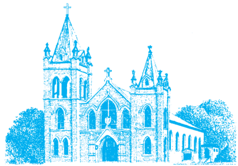
St. Gabriel Archangel